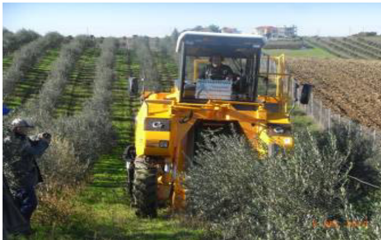
Figure 1. The straddle type mechanical harvester (Model Gregoire G120) to be used for mechanical harvesting in this study in December 2013.

Measurements with the Green Seeker (Figure 2) for NDVI (Normalized Difference Vegetation Index) and the ProChek and 5TE sensor (Figure 2) for soil properties were used to establish the digital maps shown in Figure 3 (NDVI) and Figure 4 (soil properties). Data on NDVI and soil moisture and ECa were collected from all 264 trees planted.