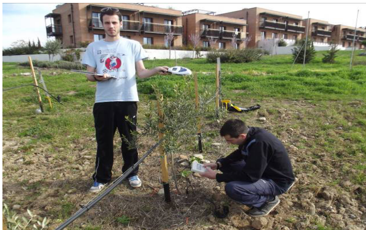
Figure 2. The Green Seeker® and the ProChek™ datalogger and 5TE sensor used to measure NDVI and soil's Volumetric Water Content (VWC), Apparent Electrical Conductivity (ECa) and temperature, on the base of each olive tree.